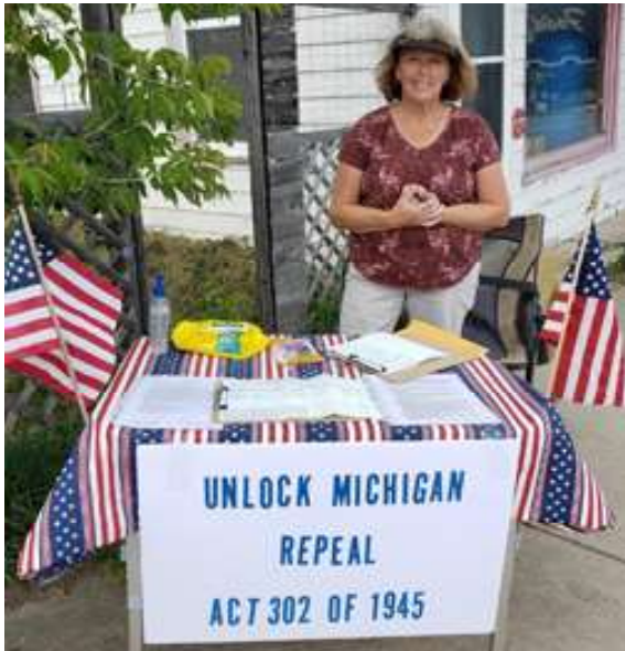
One enterprising Unlock Michigan volunteer is shown outside a Cheboygan Post Office collecting petition signatures.