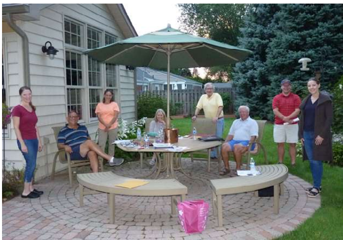
Members of the 2020 ERC leadership team take the September board meeting out-of-doors